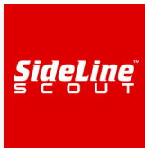
White on SLS Red