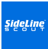
White on SLS Blue